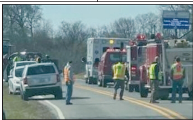
The Carlisle Police Department, Carlisle Fire Department, Nicholas County EMS, and the Nicholas County Sheriff's Office responded to the scene of an accident on Saturday afternoon, Feb. 21, 2026, around the vicinity of Lee Lynn Manufacturing, located

Nicholas County EMS says "Thank you to the courthouse staff for taking the time to strengthen their life-saving skills and commitment to public safety!" The Nicholas County EMS was happy to provide a quick AED training for the employees at the Nicholas County Courthouse.