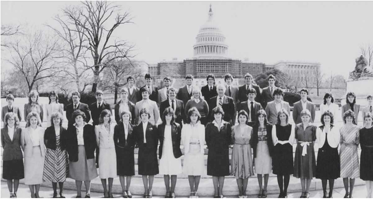
1984 Whitesburg High School Senior Trip