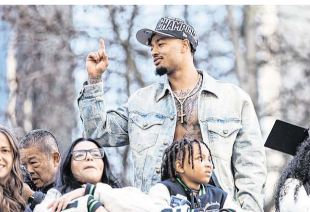
Seattle Seahawks wide receiver Jaxon Smith-Njigba, seen during the Super Bowl LX parade on Feb. 11 in Seattle, hauled in 119 catches for a league-best 1,793 yards and 10 scores over 17 starts last season.