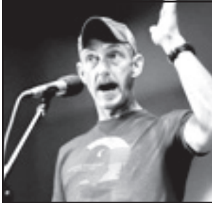
Bil Lepp hard drinks sold at the

Saturday, May 10, a buffet breakfast will be served at Trackside for $20 each. All proceeds go to Trackside, so they will be selling tickets in advance. This event usually sells out, too. You can buy tickets by calling Trackside at: (859) 340-3010. Trackside is located at 134 E. 10th Street. If you prefer not to eat breakfast, come anyway for free and bring your own chair. No outside food or drinks are allowed in Trackside.