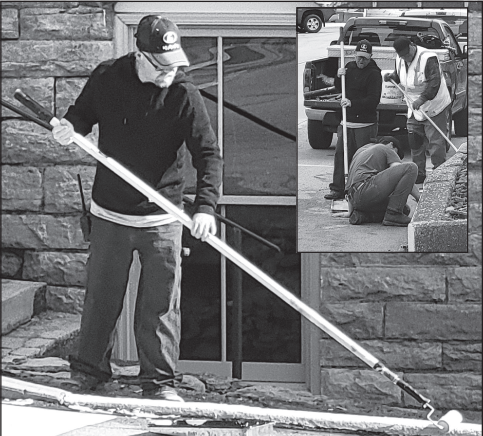
City employees were out on Tuesday morning, May 6, 2025, doing some painting, and making "The Little Town with a Big Heart" a bit nicer. Thank you guys for all your hard work! It is much appreciated!!!