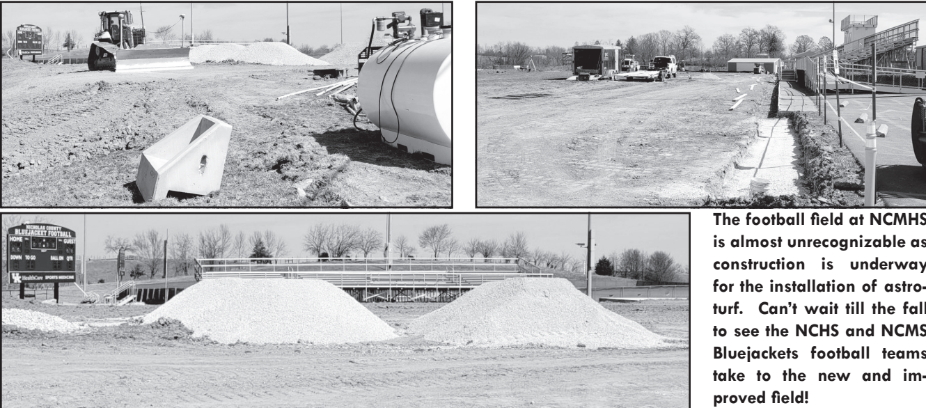
The football field at NCMHS is almost unrecognizable as construction is underway for the installation of astro-turf. Can't wait till the fall to see the NCHS and NCMS Bluejackets football teams take to the new and improved field!