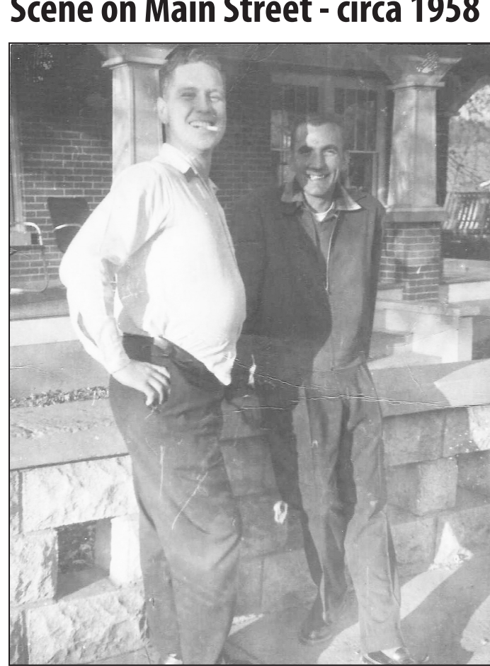
Main Street scene in Campton - circa 1958. Can you identify these gentlemen?