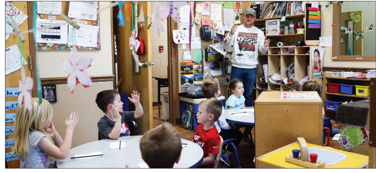
Preschool children sing before lunch at the iKids Childhood Enrichment Center, a child care provider in Benton, Kentucky.

"Conversations were not always comfortable, but they were productive," the report states. "With a focus on the private regulated child care sector, this cross-sector of Kentuckians reached consensus on more than three dozen public policy and programmatic recommendations with specific actionable items for policymakers, business lead-