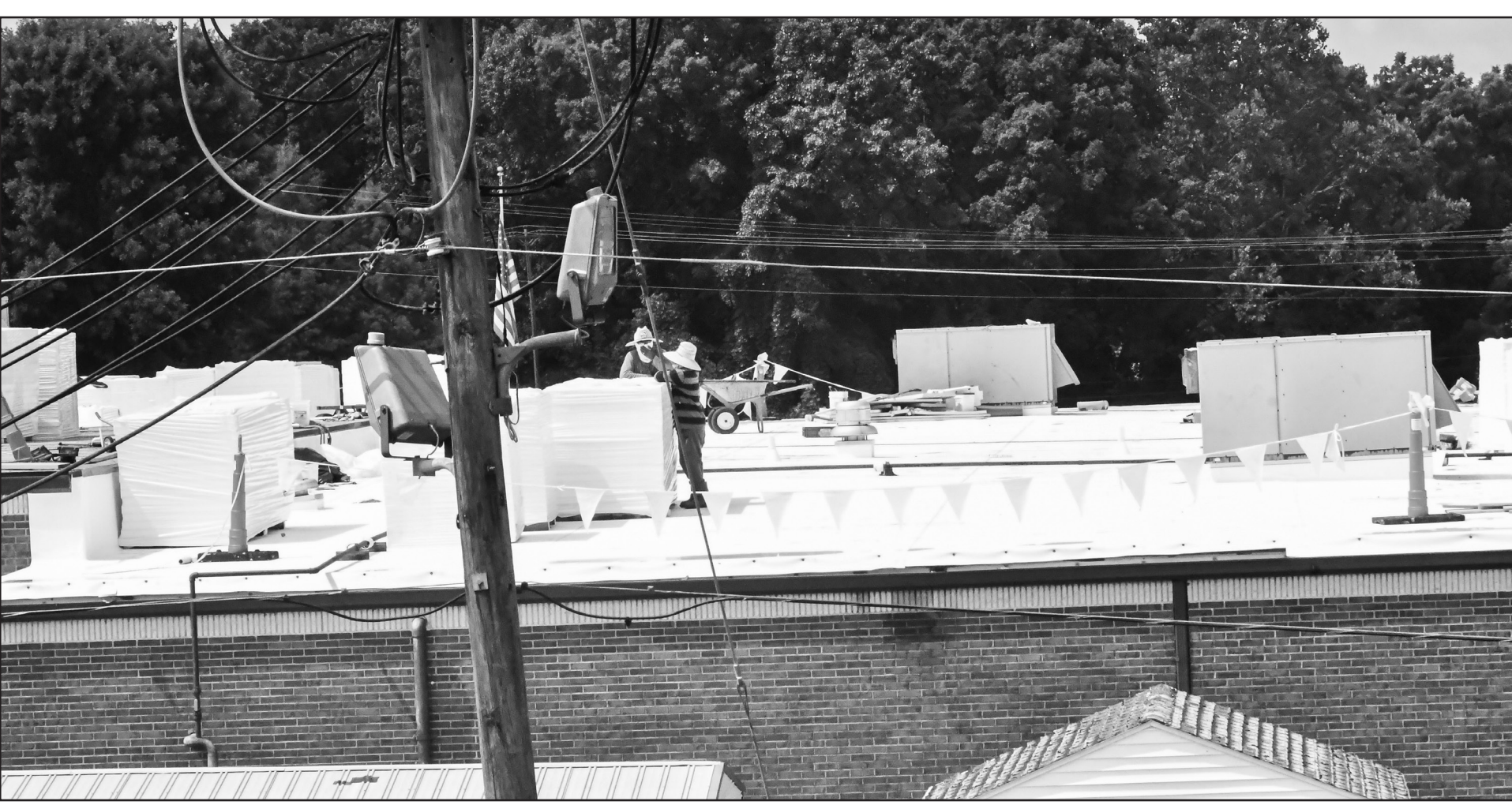
WORK CREWS ARE pictured here as they moved materials to the roof of Dixon Elementary School in preparation for a renovation project. The work on the Dixon Elementary campus is just one of several improvement projects ongoing in the Webster County School District.