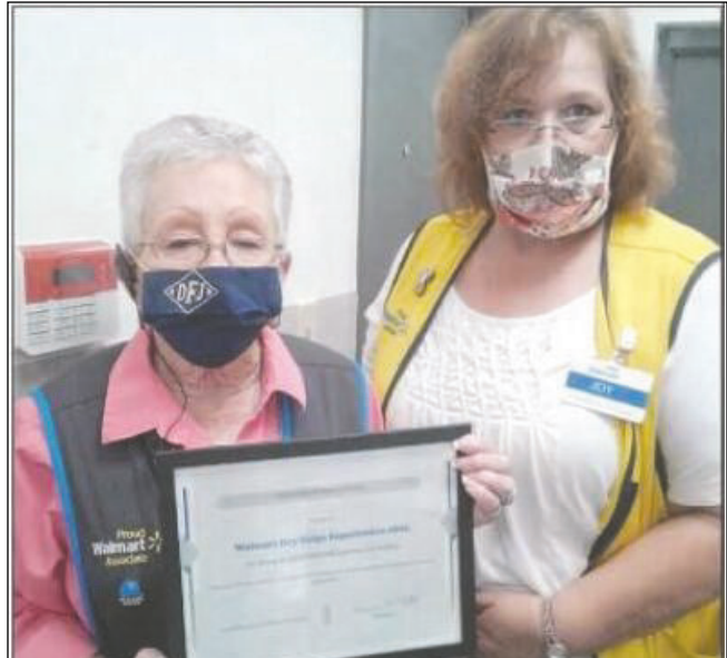
2020: Walmart Dry Ridge has donated a $100 gift card to Owen County, Northern Kentucky Community Action Commission. The gift card was used to buy school supplies.