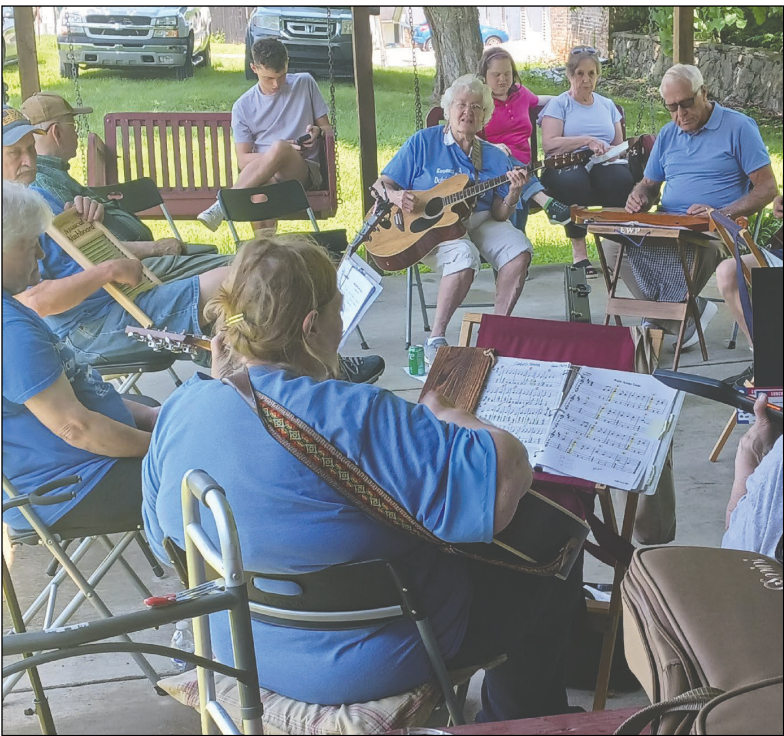
The Kentucky Dulcimer Gatherin' celebrated America's favorite hymns and songs of the past at the Historical Society's Summer Concert on Saturday, June 21. Some of its members are a beat as the chorus of dulcimers and guitars blended well into their 80's; and yet their nimble fingers don't miss perfectly in a cornucopia of