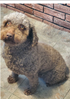
6 yr old female Spanish Water Dog

YOU MAY QUALIFY for disability benefits if you are between 52-63 years old and under a doctor's care for a health condition that prevents you from working for a year or more. Call now! 1-833-641-6772