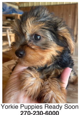
Yorkie Puppies Ready Soon 270-230-6000