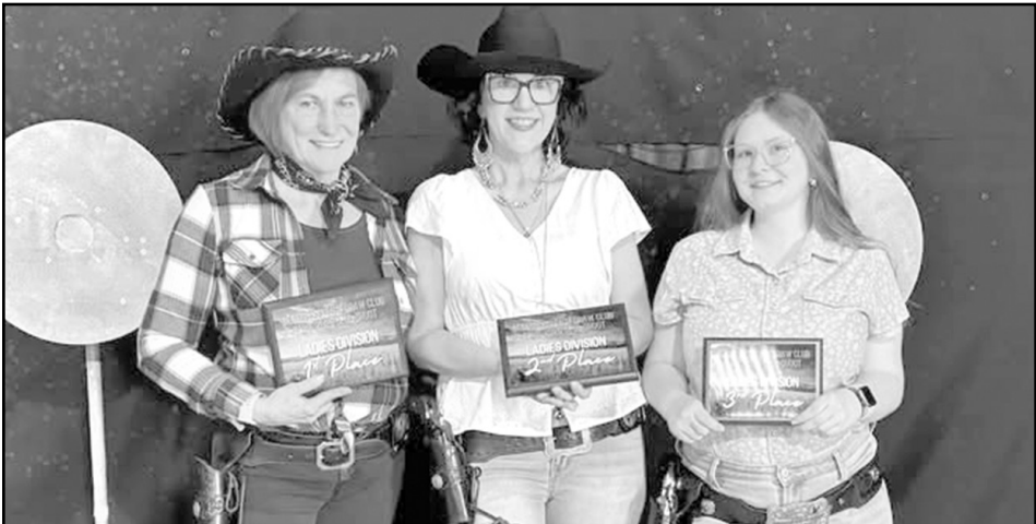
Women's Division winners