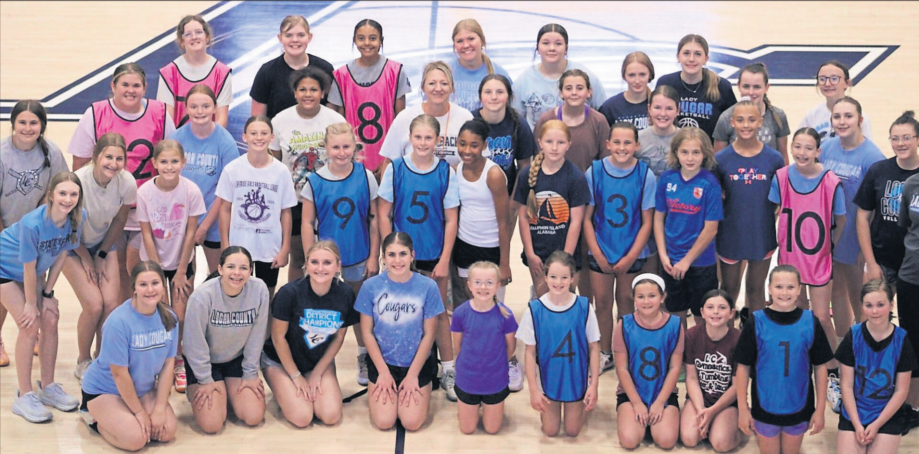
Future Lady Cougars in training attend basketball camp in the Logan County High School gymnasium Friday.