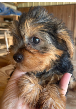
Yorkie Puppies Ready Soon 270-230-6000

If Veterinary care is unavailable or unaffordable, use Happy Jack® products to treat itch allergies, yeast infections, & cat flea infestation. SOUTHERN STATES. 270-885-4651