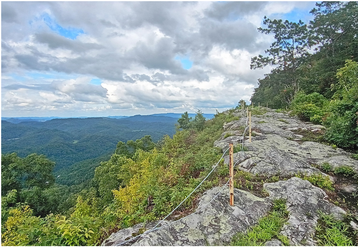
A PORTION OF RAVEN ROCK atop Pine Mountain above Jenkins is seen in this photo taken this week. The EKY Heritage Foundation has issued a request for qualifications for an architecture and engineering firm to design a lodge-style convention center on the land around the rock.