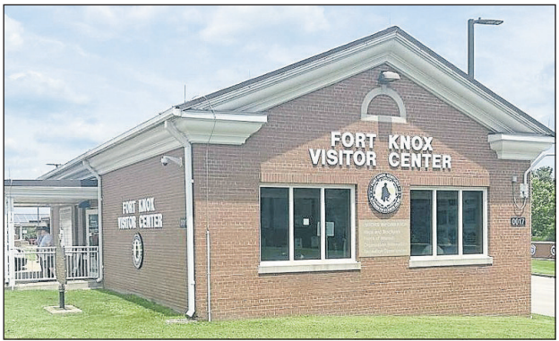
Visitors must provide a REAL ID or a passport to obtain a pass to visit the Ft Knox Army installation.