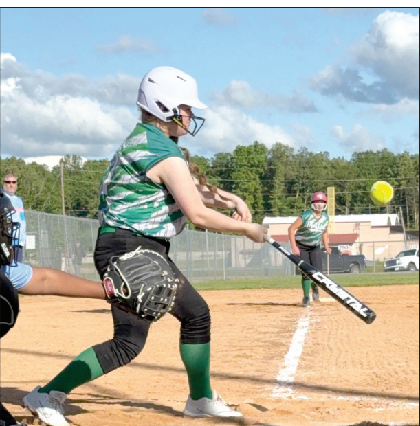
A solid hit for Mean Green's right fielder.