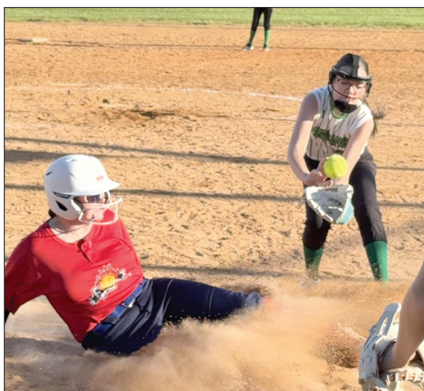
The Hericanes tried for the tag out at home, but the Patriot runner was too fast.

On Wednesday, May 14th, the earlier of two games had the Hericanes facing off against the Diamonds. The Diamonds recovered an outfield fly with a series of well executed throws, showing