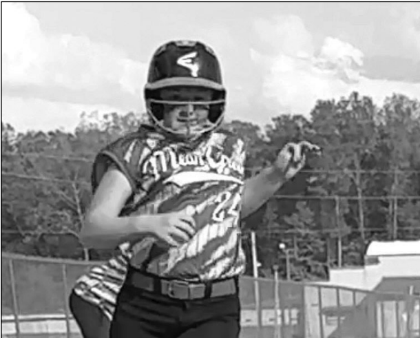
Number 24 from team Mean Green comes in for a run against the Diamonds.

in the dugout, but it was not enough to keep up with the Patriots. Mean Green played against the Diamonds for the second time this season on Wednesday, April 30th. Showing a marked improvement in both their batting and their fielding, the Diamonds lost by a significantly smaller margin than the last time they faced each other. Also playing on Wednesday, the Patriots and the Hericanes faced off for the second time this season. After a very close game the first time