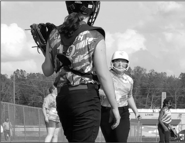
Number 13 for the Diamonds got to run home from second after a big hit by a teammate.

around, the Hericanes were able to defeat the Patriots again and hold