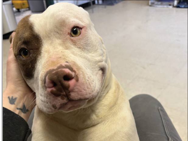
Fathead is seeking a home that loves hugs!