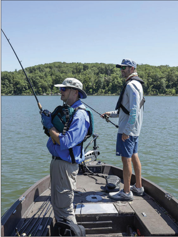
Two fisherman enjoy a peaceful day on the water—ensuring they have the proper fishing licenses is key to preserving this experience for years to come.

Anglers from throughout the central United States come to Kentucky to fish its waters, including the state's renowned trout fishery in the Cumberland River and the crappie fishery in Kentucky and Barkley lakes. Kentucky is a top destination nationally for deer hunting and maintains the largest elk herd east of the Rocky Moun-