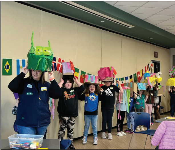
Girl Scouts taking part in the dragon dance.

KPLA members are selected - two from each KDLA region - whose ideas and efforts are moving their libraries into the future. KPLA members of any age who have been in their current position (full or part-time, certified, or uncertified) in a public library for five years or fewer are eligible. Honorees have opportunities to learn from KPLA executive leadership, committee chairs, and fellow Fresh Faces participants.