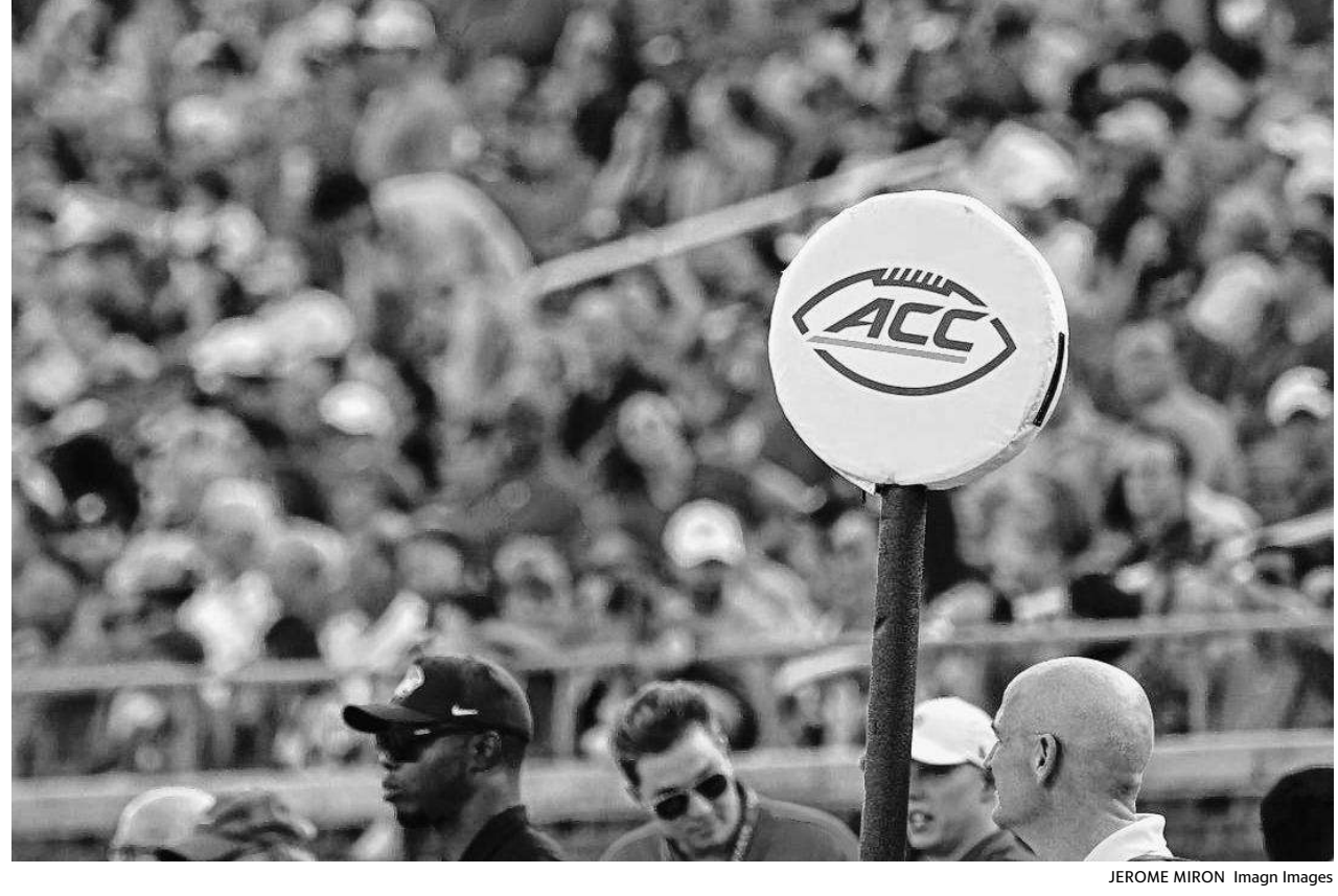
Litigation between the Atlantic Coast Conference and Florida State and Clemson is over after nearly two years of legal

So discuss your wife's plans with the book, yes. But it's not her job to make you feel better about her life before she met you. A few solo therapy sessions might help you.