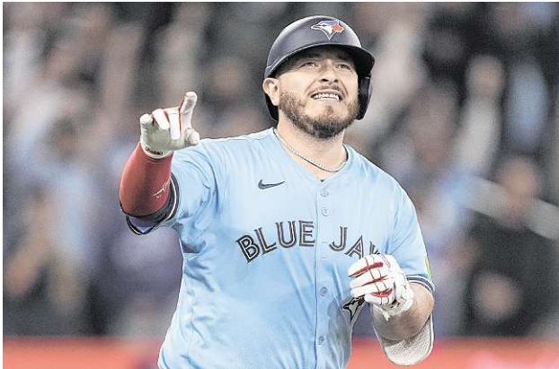
JOHN E. SOKOLOWSKI USA TODAY NETWORK

choke down your morning coffee. If you and I have been reading the same news in our lifetimes, then you've read about enough slaughter of enough innocents to put any optimism you have about humanity to as grim a reality test as any your husband could conjure. What "avid newsreader" hasn't known the darker side of humanity for quite some time — and doesn't need a good sand dive sometimes. I hope you weren't really "accused" by your husband of anything, and instead your reading of him is out of scale? Not to minimize your feelings or impugn your judgment, just to offer the possibility that it's part of the overwhelming package. Maybe he and I are coming at the same-ish thought, from different directions. Ideally, any notion of "who I am" won't be reactive to things as external as national news, no matter how immediately felt — so if your lost feeling persists, then that's worth exploring in depth. Meanwhile, though, yours is a rational response: Step back from the thing that keeps hitting you in the face, to give any swelling a chance to go down.