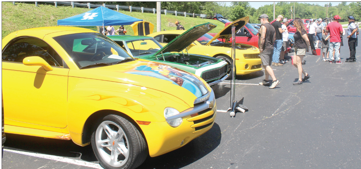
A number of vehicles were entered in the 2025 Gavin Thornton Memorial Car Show at the Green County Cooperative Extension Service Saturday, May 17. All proceeds go to the Gavin Thornton Scholarship Fund.