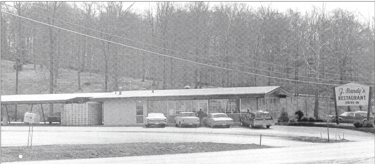
J. Bandy’s Restaurant on Columbia Highway