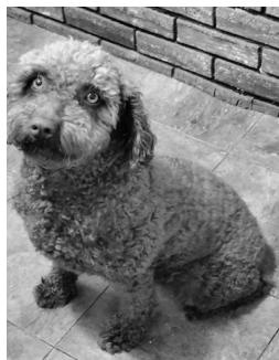
6 yr old female Spanish Water Dog

She needs a loving forever home. Lyla is in need of a new home because the owner has some health issues and is no longer able to care for her.