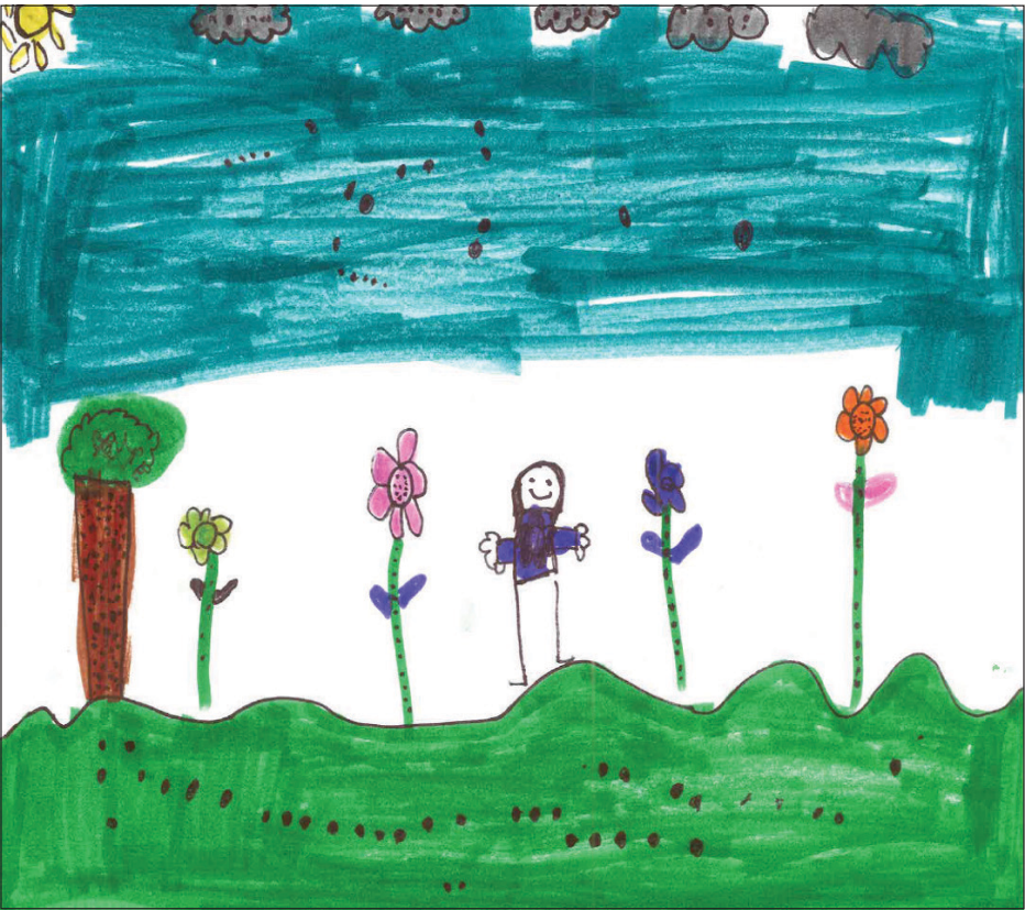
Kennedy C. | Stamping Ground Elementary School