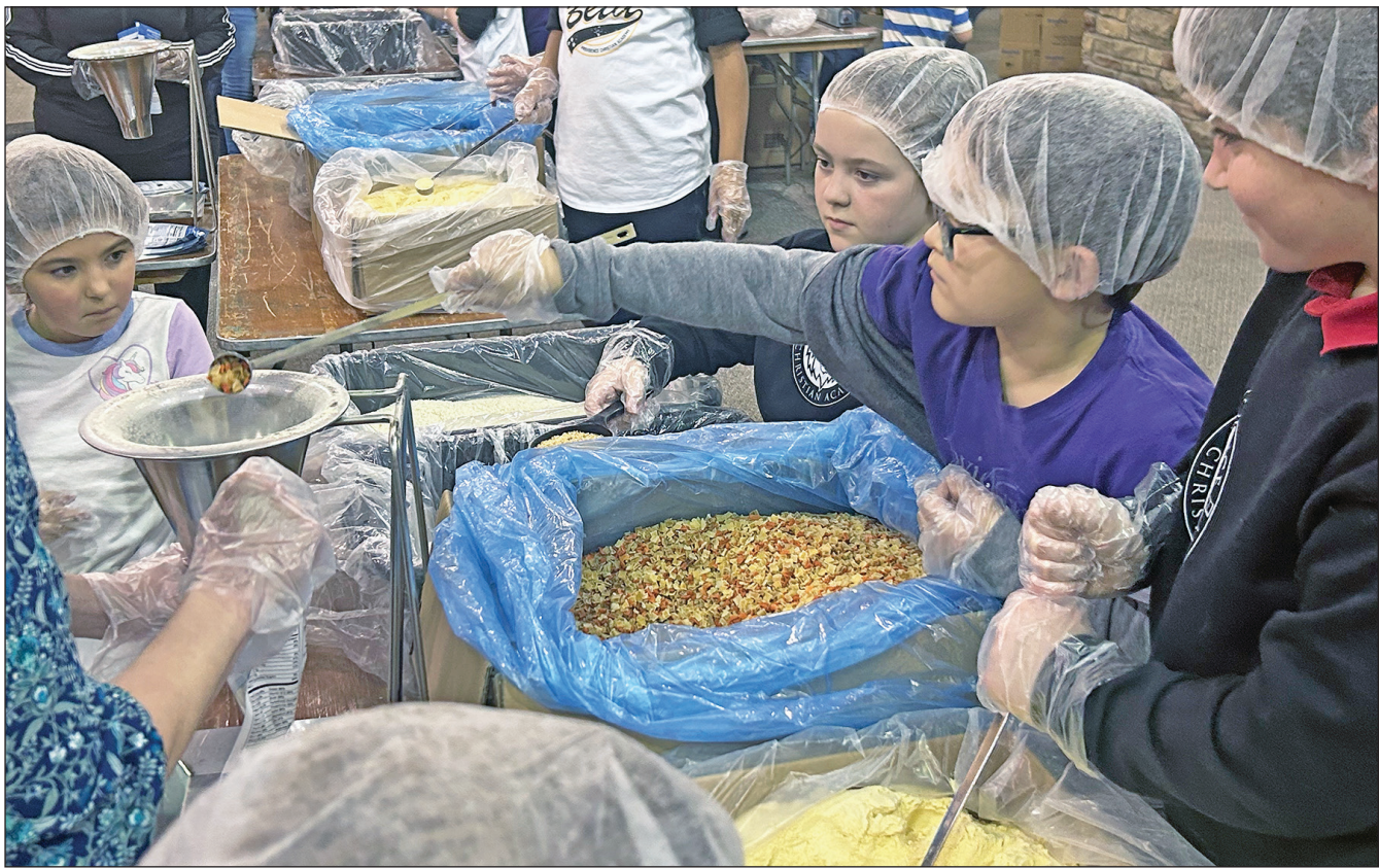
Kids of all ages from Providence Christian Academy pack nutritious meals in an assembly line for Feed My Starving Children at Grace Christian Church Friday.