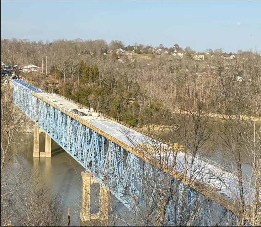
A significant amount of surface paving has been done on the Fishing Creek Bridge at the time of the taking of this photograph. A KYTC spokesperson though says there is still no word on when the bridge will officially re-open to traffic as of March 14.