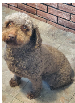
6 yr old female Spanish Water Dog

She needs a loving forever home. Lyla is in need of a new home because the owner has some health issues and is no longer able to care for her.