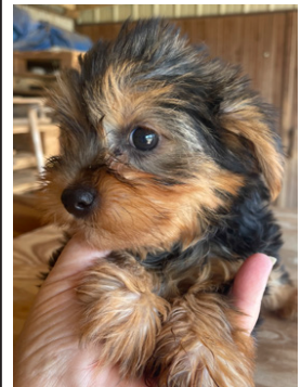
Yorkie Puppies Ready Soon 270-230-6000

Campbellsville-Mini Chiweenie Puppies for Sale 2 Females - One is strawberry with fawn coloring, the other is Chihuahua fawn color. Born on Jan 27th. First round of shots completed. Prefer to keep them together. $250 each (270) 849-6571