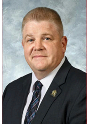
State Representative Tim Truett

As always, I can be reached anytime through the toll-free message line in Frankfort at 1-800-372-7181. You can also contact me via email at Timmy.Truett@kylegislature.gov and keep track through the Kentucky legislature’s website at legislature.ky.gov .