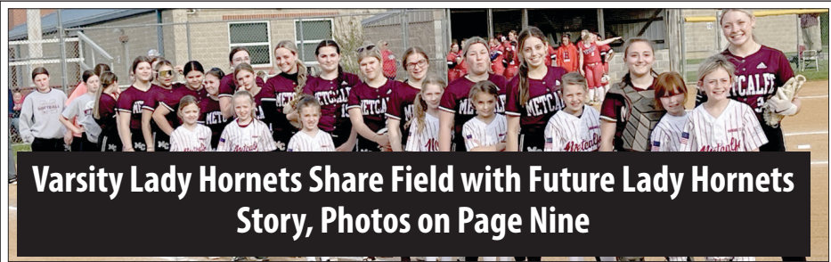
Varsity Lady Hornets Share Field with Future Lady Hornets Story, Photos on Page Nine

SUBSCRIBE TO YOUR TRUSTED NEWS & INFORMATION SUBSCRIBE TO THE HERALD-NEWS 270.432.3291