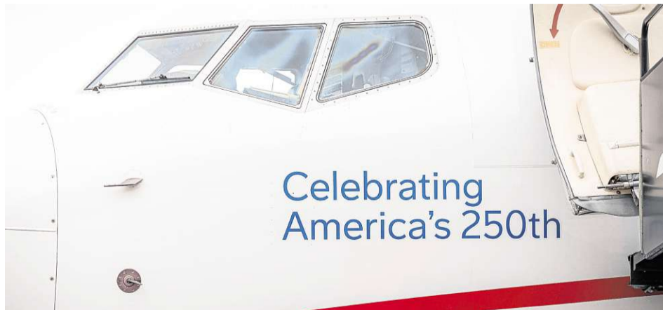
The Freedom Plane is a traveling exhibition that will bring founding-era documents to eight American cities throughout 2026 celebrating the 250th anniversary of the signing of the Declaration of Independence and the United States of America's birthday.

Writing at the height of the Cold War, historian Adrienne Koch argued that the American brand