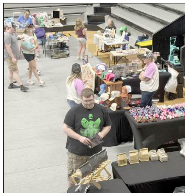
Central City Tourism hosted a Flea Market and Vendors event at Central City Convention Center on May 30, 2026.