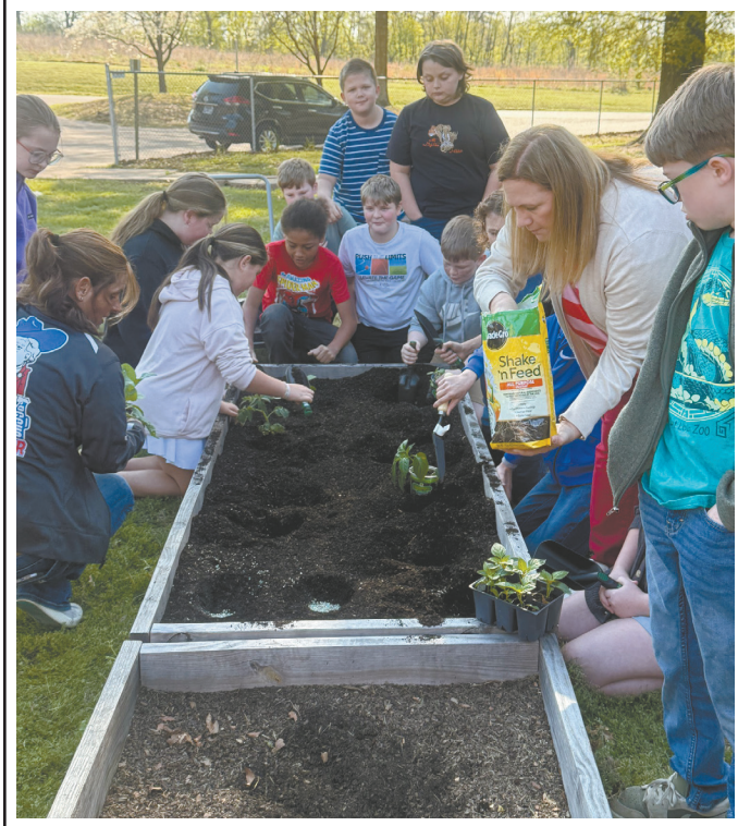
PLANTING A GARDEN – Fifth students at South Fulton Elementary have recently been hard at work planting their very own vegetable garden. Over the past month, they've been learning all about how to grow a garden. These students aren't just planting, they're taking ownership. They are fully responsible for maintaining the garden and watching their hard work come to life day by day. The goal? To have a harvest ready before summer break so they can enjoy the fruits (and veggies!) of their labor and even share with other students in the building. (Photos submitted)