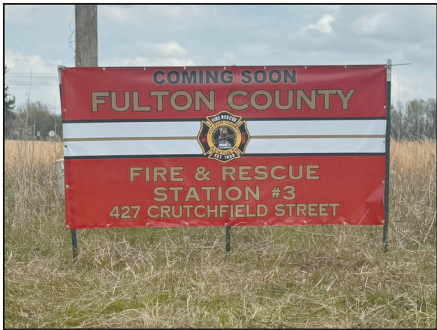
Pictured is a sign at one of the two locations where a new fire substation will be built in Fulton County.