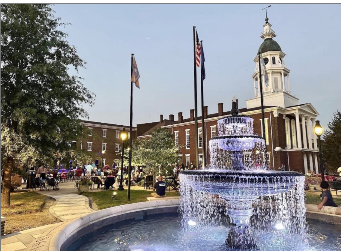
DANVILLE-BOYLE COUNTY CONVENTION AND VISITORS BUREAU

Visitors gather in downtown Danville near the Boyle County Courthouse, one of the locations highlighted in the new Boyle County KY Historic Tour app.