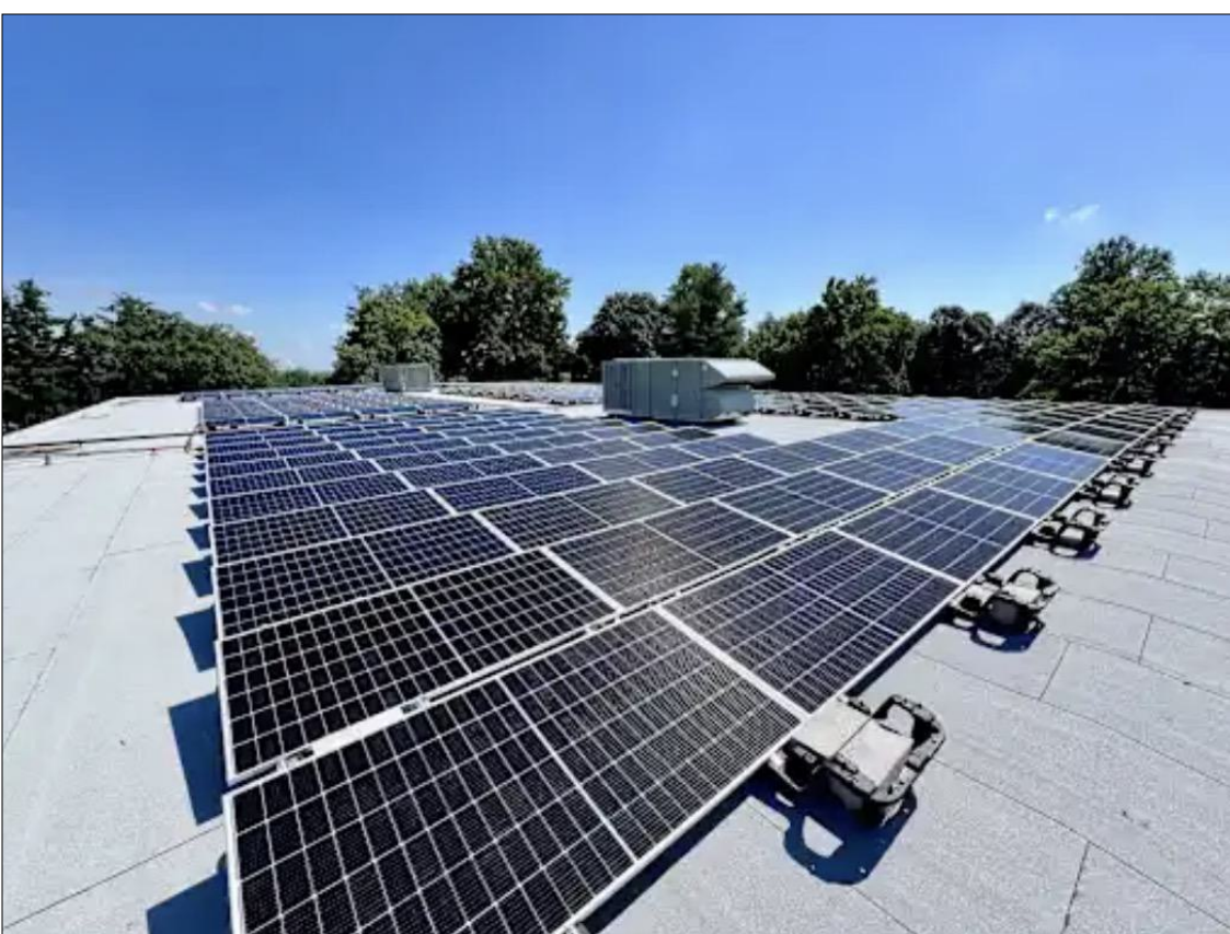
DANVILLE INDEPENDENT SCHOOLS