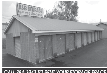
CALL 384-3943 TO RENT YOUR STORAGE SPACE

Perfect for automobile or boat storage Size 10x26 or 10x15