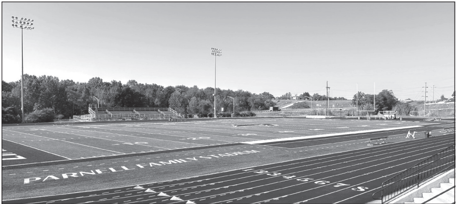
The Lakers open the season at Parnell Family Stadium at Lindsey Wilson University.