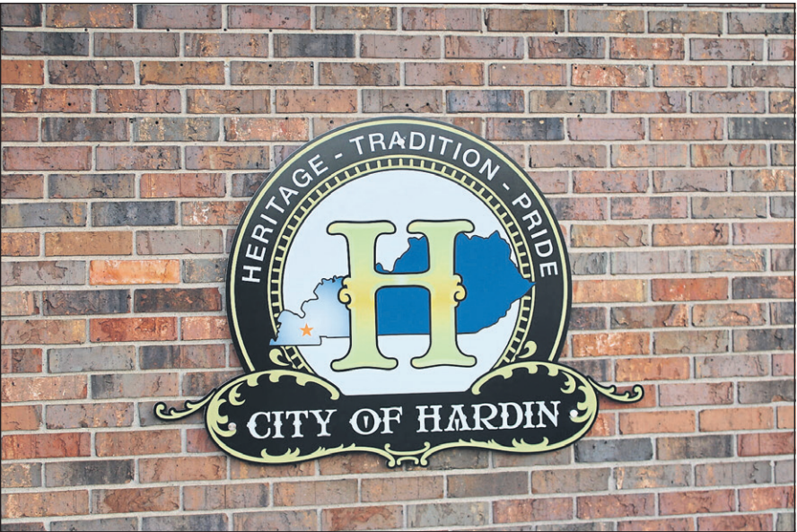
GRACE BOATRIGHT JACHIM | Tribune-Courier Hardin City Council meets the second Monday of each month at 6 p.m.

BY GRACE BOATRIGHT JACHIM GBOATRIGH@TRIBUNECOURIER.COM