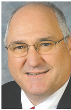
JAMES ALLEN TIPTON

As we continue to review legislation passed in the 2025 Regular Session, this week provides an opportunity to review some of the new laws passed to make state government more efficient and reflective of your priorities. Members of the House State Government Committee deal directly with the policies and administration of state government, including the legislative, executive, and judicial branches. This includes all constitutional officers, the state retirement systems, and Commonwealth's attorneys and circuit clerks. Here are several of the bills that made their way all the way through the process.