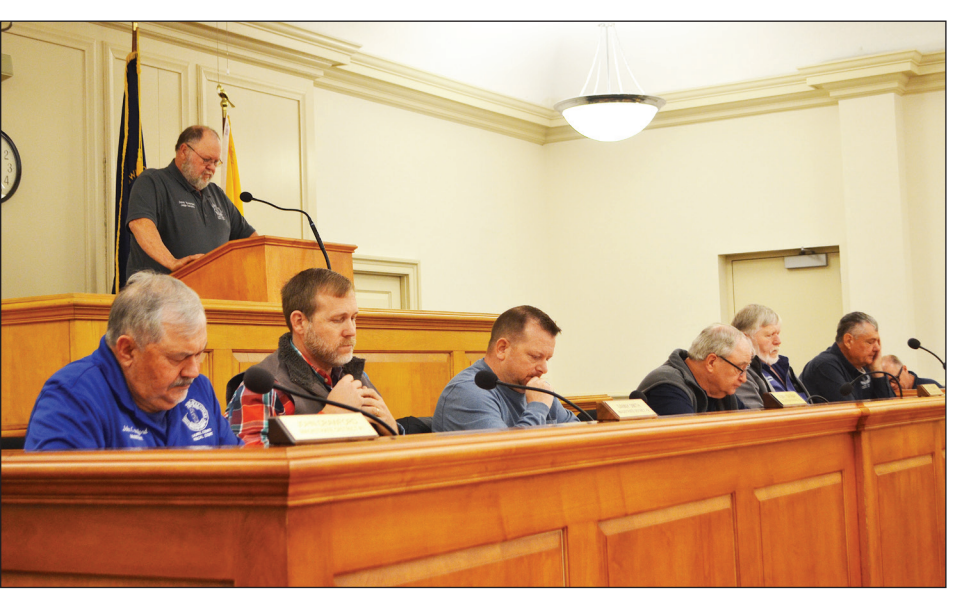
Laurel County Fiscal Court met Tuesday rather than Thursday, as several magistrates will be in Lexington attending a conference Thursday.

An indictment is an accusation only and does not imply guilt or innocence. A person is presumed innocent until proven guilty.