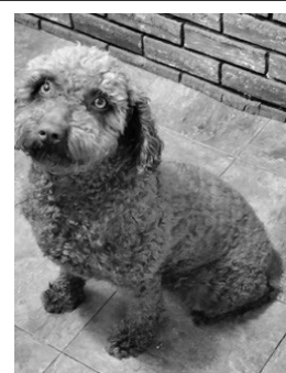
6 yr old female Spanish Water Dog

She needs a loving forever home. Lyla is in need of a new home because the owner has some health issues and is no longer able to care for her.