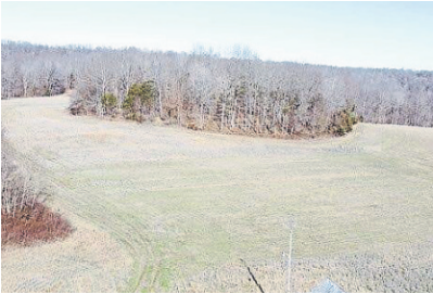
ORDER OF SALE

FIRST – Tract #3- & #4 120.52-acres m/l as a whole. SECOND – Tract #3 & #4 by the acre pick and choose.