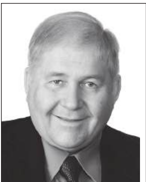
Northwest Passage By Loyd Ford

That we are not shocked speechless by such a despotic series of events is truly a measure of our loss of understanding about what should be right in the world. Perhaps we do not expect any particular act of violence, but our response to these events when they happen is certainly no