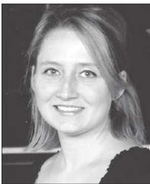
By Emily Morrison

Our nation is hurting. Not just on a macular level, but deep in the fibers of our being. At just shy of 250 years old, The United States is in the throes of adolescences. As a country we are struggling with Erikson's crisis of identity versus role confusion. Saturday's political violence in Minnesota, the No Kings demonstrations and the 250th US Army birthday parade showed our angst on full display. But there was also a window of a few hours where we were able to set these challenges