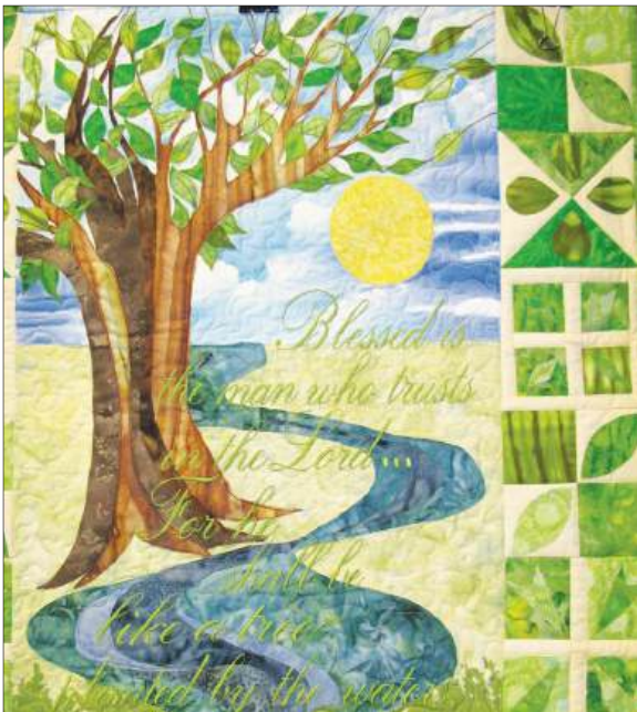
Pictured above is one of the winning quilt entries at a previous Grand Rivers Quilt Show.