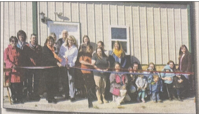
In 2015, a ribbon cutting was held for the new addition to the Breckinridge-Grayson Programs building in Hardinsburg.