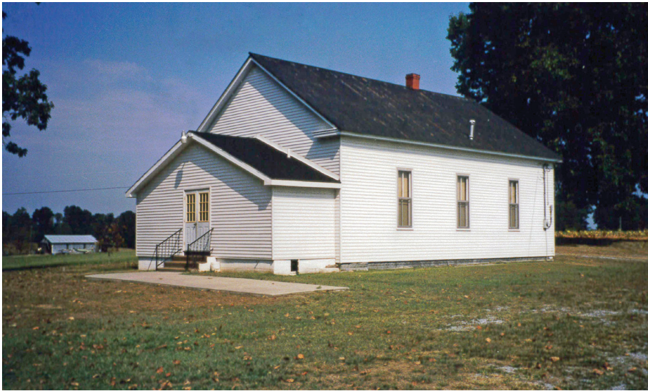
Russell Creek Missionary Baptist Church, 1998