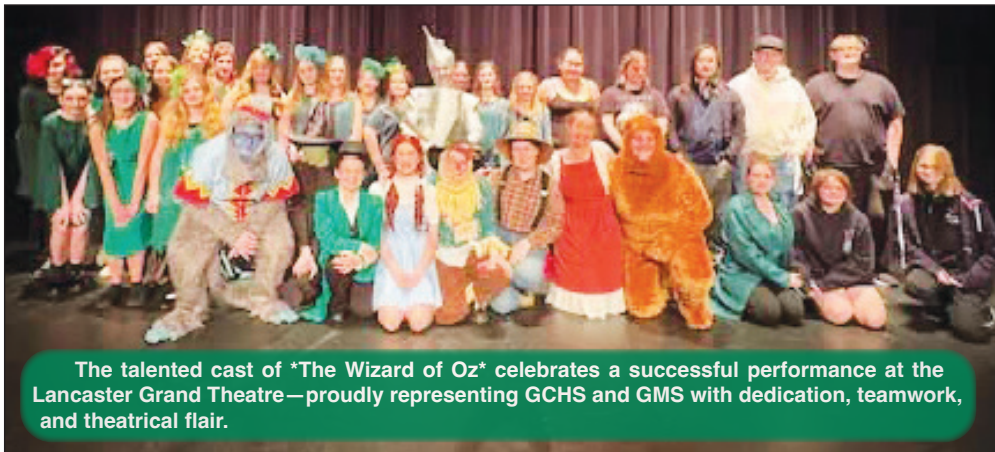
The talented cast of *The Wizard of Oz* celebrates a successful performance at the Lancaster Grand Theatre—proudly representing GCHS and GMS with dedication, teamwork, and theatrical flair.