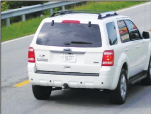
Roadside FLOCK cameras alerted local authorities to a suspicious vehicle last week.